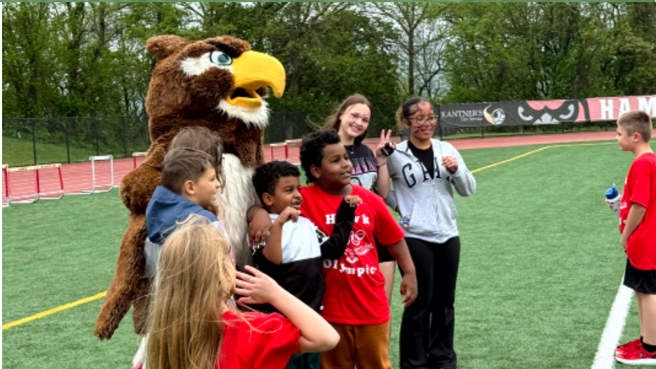
2025 Hawk Olympics